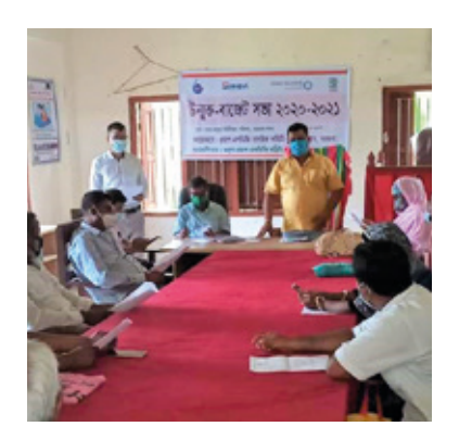
Take a picture you have...